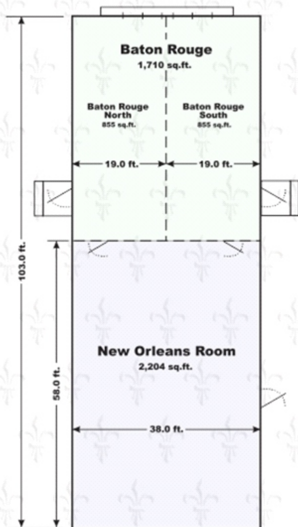
New Orleans Pavilion 3,914 sq.ft.

The Mardi Gras Hotel & Casino is proud to feature over 4,000 square feet of Multi-purpose Functions and Meetings space.